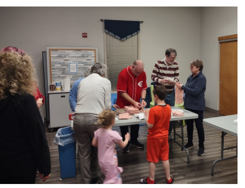
Everyone lends a hand with assembly