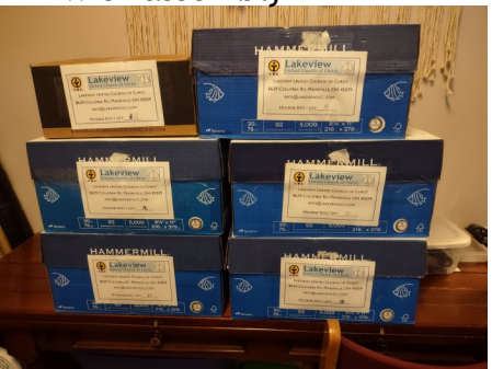
Labeled and ready to head to the depot.