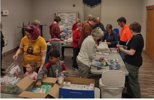
These prayers have hands and feet!