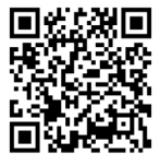
Lakeview United Church Shared Harvest & Neighbors in Need (OCC) https://www.sharedharvest.org

There are three primary programs operated by Shared Harvest, the primary one being foodbanking and distribution. Retail grocers, federal programs, the Ohio General Assembly, and co-op buying programs all contribute/allocate funds and groceries in this massive effort.